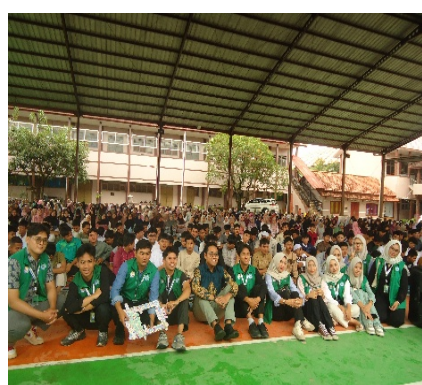
Figure 3. Socialization of Juvenile Delinquency and Sexual Health Education at SMAN 1 Gegesik Wetan

In general, educational activities received a positive response from participants. This can be seen from the active participation of students during the activity, such as through discussions and question-and-answer sessions. The increase in knowledge gained through this activity is expected to help form more positive behaviors in daily life.