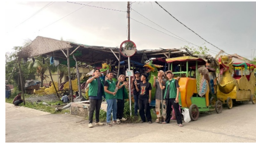
Figure 8. Installation of Convex Glass at 2 points at the Pringgadani Intersection