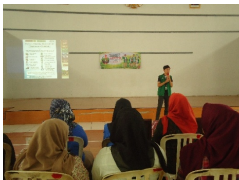
Figure 6. Socialization of the Decile Concept

The implementation of this community empowerment activity shows that the community has sufficient interest in activities that provide direct benefits in daily life. In addition to increasing knowledge, this activity also encourages the community to be more concerned about environmental management and the use of existing resources more optimally.