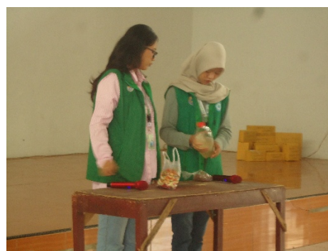
Figure 7 Workshop Ecoenzyme