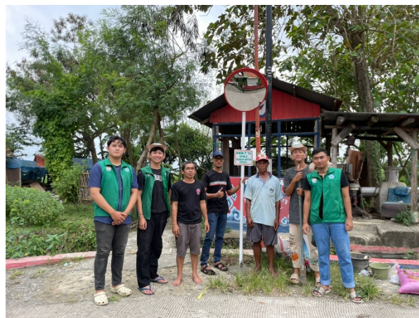
Figure 9 Convex Glass Installation at Hamlet Bend 5