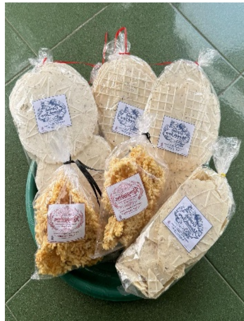
Figure 5. Geplak Products with Logo Innovation, Halal Certificate, and NIB