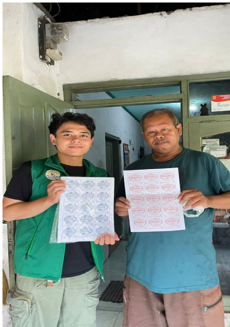
Figure 4. Submission of New Logo, Halal Certificate, and NIB

This assistance aims to increase the legality of business operations while strengthening product identity, thereby increasing consumer trust. In addition, this activity provides business actors with an understanding of the importance of branding and legality in increasing product competitiveness in the wider market. Through the OVOP approach, it is hoped that local village products can add value and become a village economic identity that can be developed sustainably. This program has succeeded in becoming a bridge between the academic world and the village community's real needs while strengthening the MSME economy. (Laia, 2022)