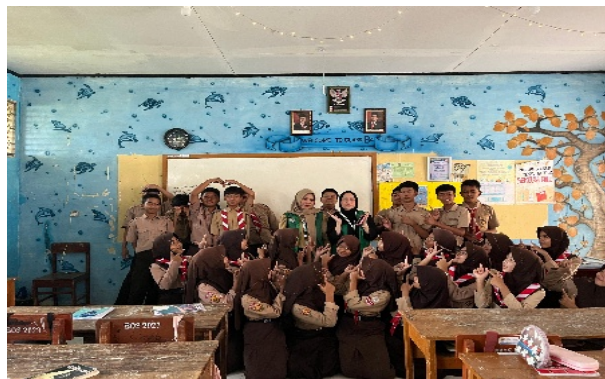
Figure 2. Socialization of Anti-Bullying and Skin Health at SMPN 1 Gegesik