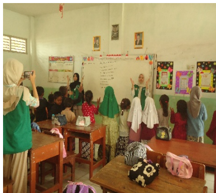
Figure 1. Socialization of PHBS at SDN 1 Gegesik Wetan