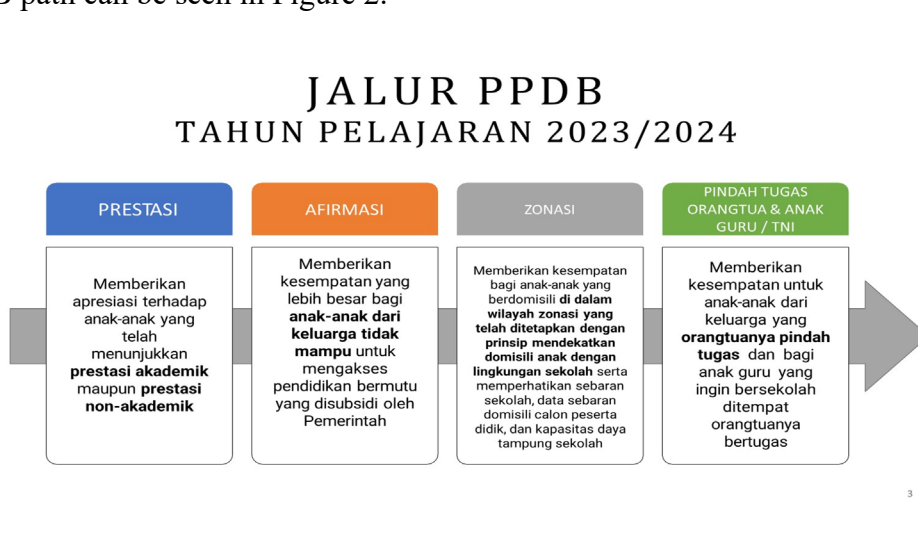
Figure 2. PPDB Line