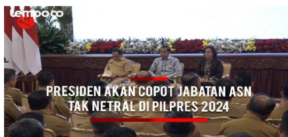
Figure 5. President Will Remove Non-Neutral Civil Servants in 2024 Presidential Election