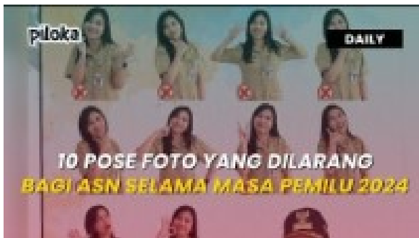
Figure 4. Ten photo poses prohibited for civil servants during the 2024 election period

SKB" Joint Decree" Menpan RB, Minister of Home Affairs, Chairman of KASN, Head of BKN , Chairman of Bawaslu : -No 2 Th 2022 - No: 800-5474 Th 2022 – No 246 Th 2022 -No 30 th 2022, - No 1447-1 / PM-01 / K.I / 09 /Th 2022 concerning Guidelines for Guidance and Supervision of Neutrality of Civil Service Employees in the Implementation of Elections and Direct Regional Elections.