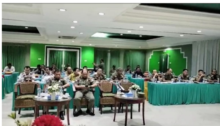
Figure 1. Socialization Activities

The Socialization of the Position of Civil Service Problems in Elections and Elections Perspective Law No. 7 of 2017 Jo Law No. 20 of 2023 was held on Tuesday, December 5, 2024, at the Emerald Hotel, Jalan Wahidin Sudirohusodo Cirebon City. It was attended by employees of the Civil Service Police Unit (Satpol PP). Community service is carried out by delivering material through presentations and discussions. The City Government of Cirebon organized the event. Socialization activities can be seen in Figure 1.