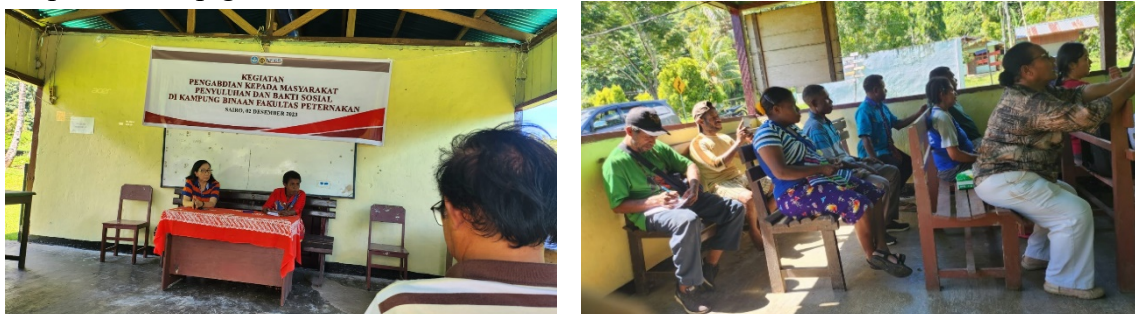
Figure 2. Implementation of Counseling

Counseling was carried out by lecture method while at the village hall of Sairo village. Some things that farmers need to know regarding pig feed are: 1. Nutrition for pigs; 2. Feed Ingredients for Pig Feed; 3. How to Determine the Proper Preparation of Pig Feed; 4. Preparation of pig feed.