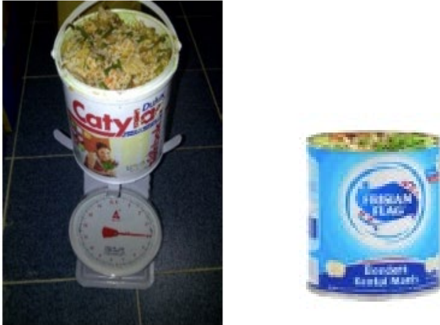
Figure 3. Paint cans 5 kg and milk cans 385 g

The following are some examples of pig feed that can be imitated because it is prepared using feed ingredients that are around us.