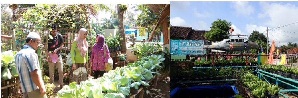
Figure 2. Chemical-free plant cultivation in Kampung Liman Benawi, Trimurjo, Central Lampung