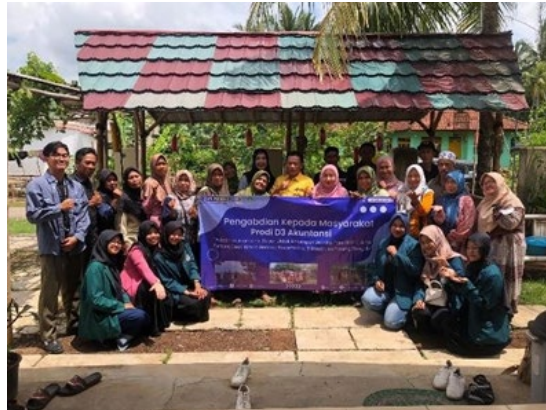
Figure 9. Closure of training activities

After the evaluation, the training on Financial Governance for edu-agrotourism of KWT Bina Pertani, Kampung Liman Benawi, Trimurjo, Central Lampung, was considered done. Participants took part in this activity enthusiastically and seriously, so it took place smoothly and succeeded well. The activity ended with photos taken with participants, members of KWT Bina Pertani, and village civil servants (Figure 9).