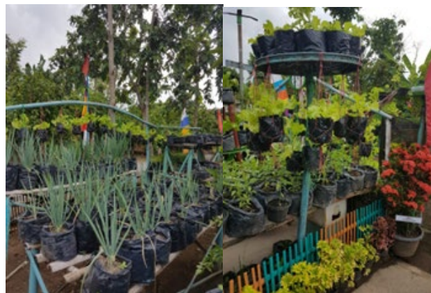
Figure 1. A variety of cultivated crops, including vegetable crops in Kampung Liman Benawi, Trimurjo, Central Lampung

The existing and developed local potential resources comprise a variety of cultivated crops, including vegetable crops (Figure 1) such as pakcoy, Malaysian mustard, bitter mustard, chives, cauliflower, chilies, eggplant, tomatoes, kale, celery, and leeks. The assortment of houseplants includes bombay silk flowers, paper flowers, cosmos flowers, episcia flowers, and tembelekan flowers. The kitchen spice plants encompass turmeric, ginger, kencur, temulawak, kunci, and white turmeric. Additionally, there are several fruit plants, including mango, orange, and longan. These cultivation activities, which have been ongoing for two years, contribute to the development of edu-agrotourism. The cultivation is carried out in the yards of community homes, with a diverse range of types for each resident (Figure 2).