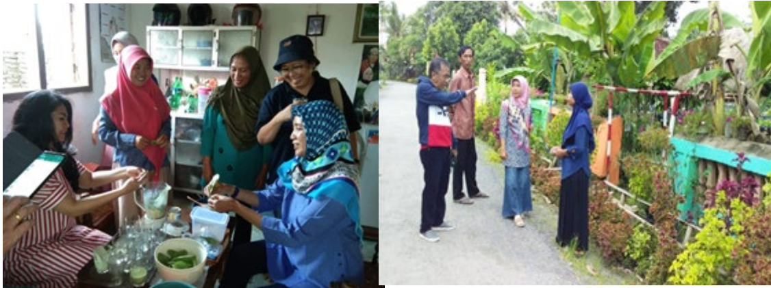
Figure 3. Training on making vegetable juice and guide in Kampung Liman Benawi, Trimurjo, Central Lampung

distribution of guest groups, naming plants, and culinary presentation of vegetable juices created by the KWT Bina Pertani (Figure 3), as well as uniform preparation for the Bina Pertani Pokdarwis team and the Lampung Kagama assistance team.