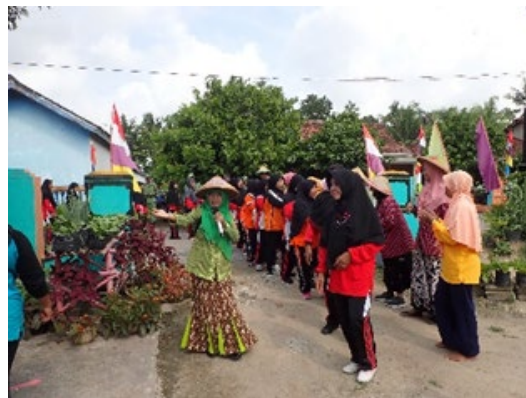
Figure 4. The performance of traditional dance to welcome the tourist

The reception of guests commenced with a welcome drink of pakcoy juice, followed by a performance of traditional dances by the Kampung Liman Benawi dance group (Figure 4). This was succeeded by a guided garden tour conducted in groups. Each group was led by a guide from Pokdarwis Bina Pertani (Figure 5). Opportunities for shopping for vegetables or plant seeds were available during the tour, with a designated sales spot expressly provided.