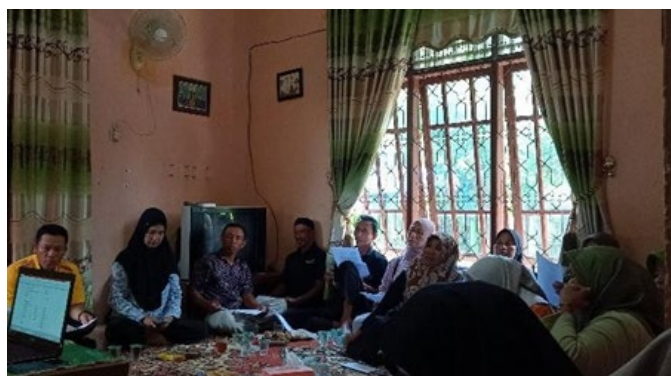
Figure 8. Discussion and evaluation with participants

After the training, the results of the participants in this training activity were discussed and evaluated (Figure 8).