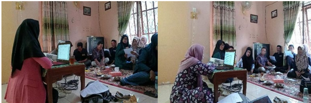
Figure 6. Speakers addressed the materials to the participants

recording transactions, simple bookkeeping, preparing financial statements, and strategies for determining the selling price of crops were provided (Figure 6).