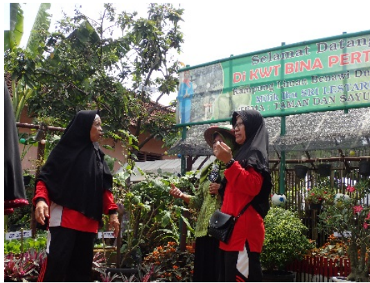
Figure 5. Agrotourism led by the local guide of Pokdarwis Bina Pertani, Kampung Liman Benawi, Trimurjo, Central Lampung

This training is expected to provide knowledge and skills in recording, bookkeeping, and financial statements. Thus, financial statements can be appropriately recorded, organized, and transparent. The purpose of this activity is so that members of KWT Bina Pertani can improve their understanding and financial management skills and ultimately be able to manage their agricultural business finances better, increase income, determine the selling price of crops, and optimize the potential of their land.