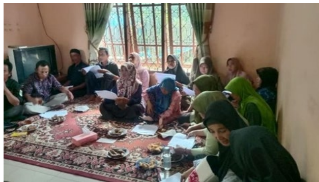
Figure 7. Exercise on financial statement preparation accompanied by companionship

In addition to delivering material, the speakers also assisted participants in directly practicing simple bookkeeping, preparing financial statements, and strategies for determining the selling price of crops (Figure 7).