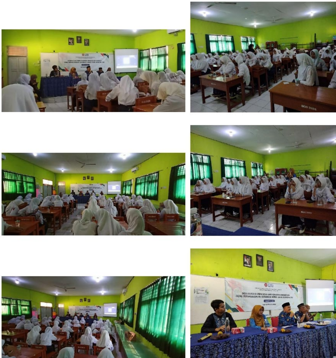
Figure 1. Activity

The data from the pretest and post-test results were tested for effectiveness; the effectiveness test in this study used SPSS V.21.0 for Windows with a paired t-test, namely using a paired sample t-test. The hypotheses are: