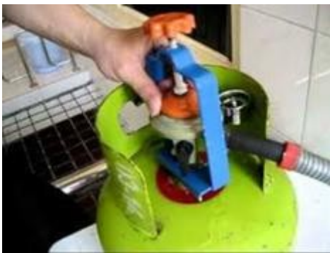
Gas stove regulator inspection