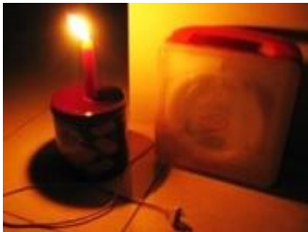
Candles when the power goes out

The potential fire hazard that often occurs is due to negligence in the use of candles during power outages.