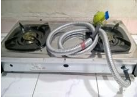
Gas stove hose inspection

attached to the tube, the leaking hose is due to rat bites or splitting due to old age and the hose tie clamps are loose.