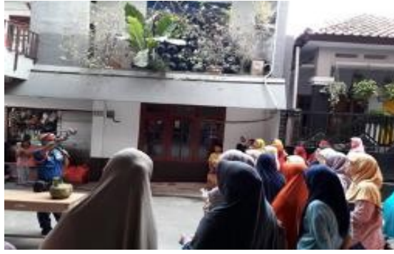
Instructor practicing leak prevention on gas stoves