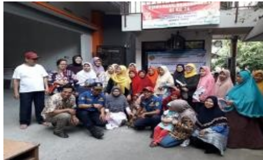
Documentation with the team, instructors and trainees

Fire prevention and handling training activities can provide knowledge about the factors that cause fires at home and know the preventive measures, so that it can encourage public awareness to reduce the potential fire hazards that can be carried out in daily activities. Factors that can be the source of the cause of house fires are the use of gas stoves, electrical short circuits and negligence factors in using equipment.