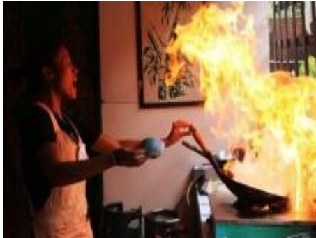
Fire from the stove

Negligence is often the dominant factor, for example, leaving food ingredients that are being fried for a long period of time so that it can provoke a fire from the stove up to the frying pan which eventually forms a large fire on top of the frying pan that causes a fire.