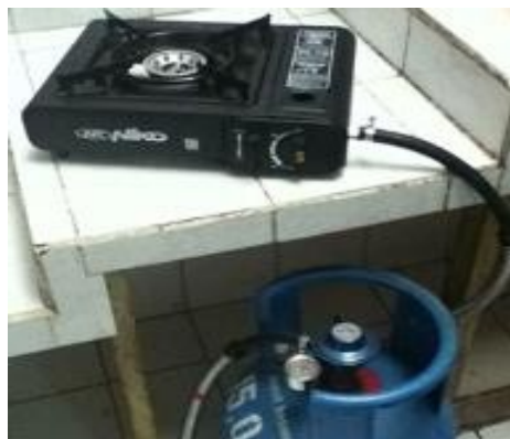
Placement of the stove and gas cylinder at a safe distance

Fire prevention measures can be taken by controlling combustible materials so that they do not meet the other two elements. In cooking activities in the kitchen, you can identify the potential for fire from the cooking utensils used, namely checking the condition of the gas stove and gas cylinder, when doing cooking activities, make sure you are not doing other activities to avoid negligence that can result in a fire. Make sure the stove and gas cylinder are placed at a safe distance to avoid heat transfer from the stove can propagate to the gas cylinder.