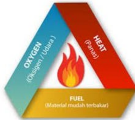
Triangle of fire