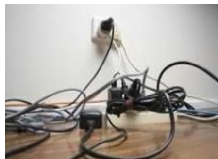
Electrical Circuit: Parallel Consumption