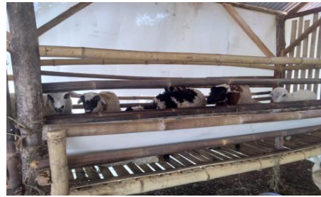
Figure 3 Healthy Nature School (3) Figure 4 Healthy Nature School (4)

This activity was carried out by providing material in the form of a talk show. In this activity, sharing and interactive discussions were carried out, where the participants were mosque teenagers. This activity was carried out because of the rampant early marriage carried out by teenagers starting from junior high school age. Pregnancy in adolescent girls is due to excessive close relationships between teenage boys and girls so that they have sex outside of marriage, causing their parents to marry at an early age (Tampubolon, 2021).