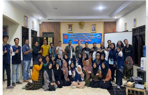
Figure 6 Talkshow Prevention of Early Marriage

The impact felt socially by mosque youth who participated in the talk show was a positive response to the talk show activities where they added new knowledge about the influence of hormonal food intake on adolescent sex behavior and the negative impact of early marriage, the environmental implications felt was the enthusiasm of residents to participate in the implementation of ancient agriculture carried out in the Cihanjuang hut, The economic impact is that through the Ancient Agriculture Program, residents are not only equipped with knowledge but can create businesses by producing several agricultural products that can be sold with a clear market share so that they are not afraid of losing consumers.