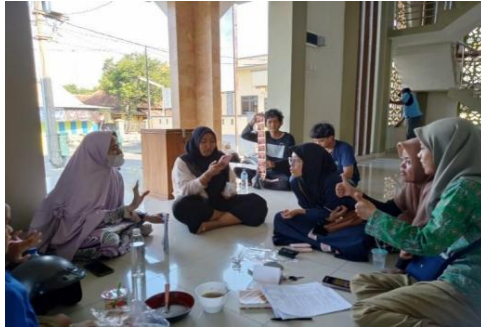
Figure 5 Determination of Talkshow Material

negative impact on their reproductive health and Unwanted Pregnancies (KTD), where the most pronounced are adolescents who experience drowning syndrome during pregnancy so that their children have low birth weight (BBLR) and also miscarriage (Octavia, 2018).