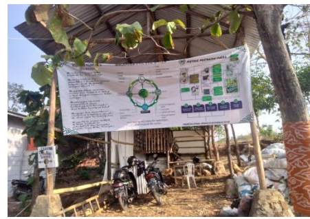
Figure 2 Healthy nature school (1) Figure 3 Healthy nature school (2)