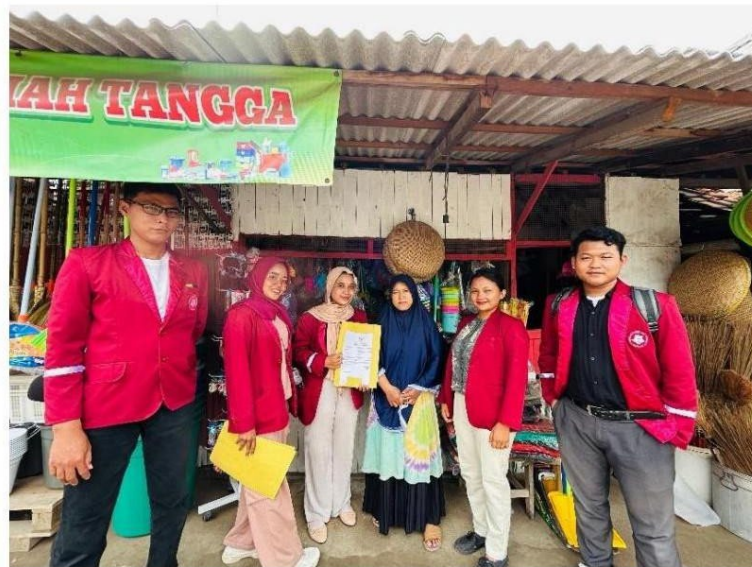
Figure 2. Submission of NIB certificates to MSMEs Kedungjaya Village