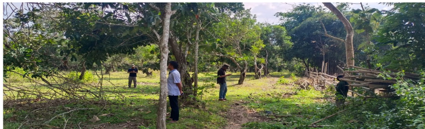
Figure 5. Taking vegetation landscape in Dusun 5, Labuhan Ratu VII

From the documentation taken using a mobile phone, detailed data including location, time and geographical information can be recorded. Vegetation data collection was also conveyed and practiced by visiting the location of the interaction of sumatran slow loris with the community in Dusun 5, Labuhan Ratu VII (Figure 5).