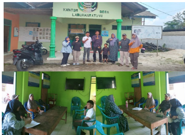
Figure 1. Meeting at Labuhan Ratu VII Headquarter, Labuhan Ratu, East Lampung

The meeting with the community was carried out, with the village officials (Figure 1) at the Labuhan Ratu VII Headquarter, Labuhan Ratu, East Lampung, the secretary and community representatives. Understanding the existence of sumatran slow lorises on the power grid is well known, including public responses to the interaction of sumatran slow lorises