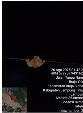
Figure 4. Documentation and data collection of interaction points with sumatran slow loris by Tatang Supriyadi

From the documentation taken using a mobile phone, detailed data including location, time and geographical information can be recorded. Vegetation data collection was also conveyed and practiced by visiting the location of the interaction of sumatran slow loris with the community in Dusun 5, Labuhan Ratu VII (Figure 5).