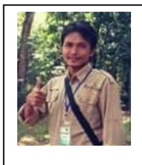
Sunandar Pokdarwis Gerbang Way Kambas, Labuhan Ratu VII, East Lampung