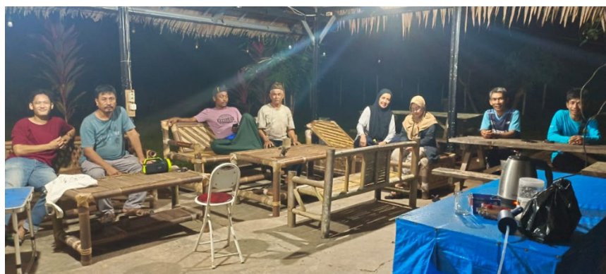
Figure 2. Meeting at the Dusun 5 camping ground, Labuhan Ratu VII, East Lampung

The introduction and understanding of the existence of sumatran slow loris was also conveyed through a meeting in the camping ground area located in Dusun 5, directly adjacent to the WKNP area (Figure 2).