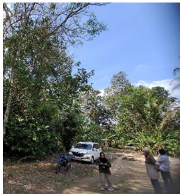
Figure 6. Interview with the community in Dusun 5, Labuhan Ratu VII

Companionship is also carried out to obtain information from people whose live close to the location of the interaction of sumatran slow loris with the electrical grid (Figure 6).