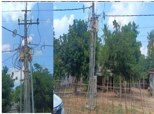
Figure 3. Sumatran slow lorises conflict mitigation tool and power grid in Dusun 5, Labuhan Ratu VII, East Lampung

Conflict mitigation efforts by PLN with the installation of conflict mitigation tools have been carried out with the concept of barriers in the form of cap, rotary, fibers and insulator caps (Aji and Mashdurohatun, 2021). The introduction of existence of conflict mitigation tools caps, rotaries, fibers and insulator caps (Figure 3) that have been installed in the area is also conveyed as a form of protection for sumatran slow loris who carry out activities using electrical network cables. Conflict mitigation tools aim to secure sumatran slow loris on the power grid and minimize the potential for power grid flow disruptions.