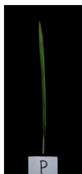
Figure 2. Mareum cultivar rice leaves (dark green color) (Personal Documentation, 2022)