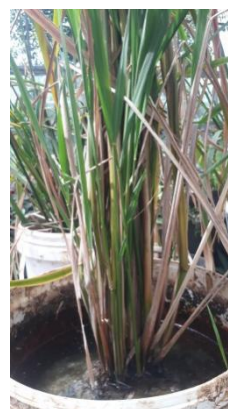
Figure 5. Upright Growth Habit (Mareum cultivar)

The length, thickness and color of the stem nodes of the 18 local rice cultivars observed can be seen in Table 3.