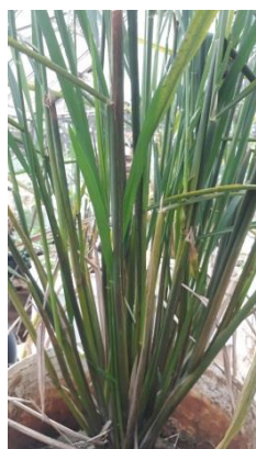
Figure 3. Semi-erect growth habit (gemah cultivar)