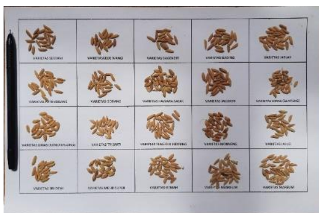
Figure 6. Shape of Grain

Godang, Hawara Salak, Omas Genteng, Tri Sakti, Jalan Sri Dewi, Egypt Super, Gemah, Masreum, and Mareum are brown-colored cultivars; Bagendit is a yellow-colored cultivar. The Sertani, Gede Wangi, Gading, and Jablay Patenggang cultivars have light brown grain color characteristics. Table 6 and Figure 6 show the grain's color and form features.