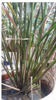
Figure 4. Slightly Upright Growth Habit (Tri Sakti) Personal documentation, 2022