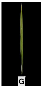
Figure 1. Godang rice cultivar leaves (green)

The bush rice has distinct leaf sections, content, and shape. Scales and leaf spines are two characteristics that set rice leaves apart. Though the cultivars Gading, Jablay, Tri Sakti, Jalan, Egypt Super, Gemah, Masreum, and Mareum have dark green leaf color, the cultivars Sertani, Gede Wangi, Bagendit, Patenggang, Godang, Hawara Salak, Omas, and Sri Dewi all have the same leaf color (Table 2).