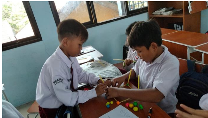
Figure 3. Making a Space build from plasticine and straws

After the introduction then give an explanation of the core activities. In the core activity, students carry out learning activities with an explanation of building space and applying the Pjbl learning model, where students are asked to make works in the form of building space including building cubes, blocks, prisms, and pyramids.