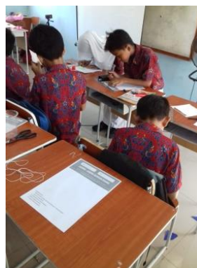
Figure 6. Project Creation

Props are made to make it easier for students to see directly the shape of the building space, see the characteristics of the building space, namely there are ribs, sides, corner points, and diagonal planes. Students are divided into groups of 5 groups to make space nets from origami paper and mattress thread.