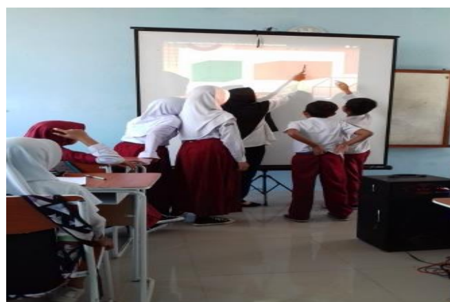
Figure 2. Learning Implementation

In this cycle, the learning process takes place based on a predetermined learning implementation plan (RPP). In the implementation of Mathematics learning, the steps of learning activities or learning processes that will be carried out previously are gathering students to march, pray, absenteeism, stimulate students' initial knowledge of the material of building space, core activities and closing activities. The implementation of the introduction students listen to the teacher's explanation presented through the Canva application, then students are asked to analyze the various types of building space.