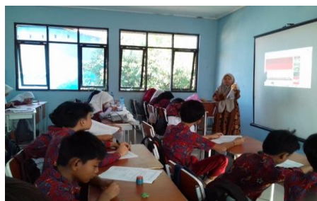
Figure 4. Learning Implementation

In this cycle, the learning process takes place based on a predetermined learning implementation plan (RPP). In the implementation of Mathematics learning, the steps of learning activities or learning processes that will be carried out previously are gathering students to march, pray, absenteeism, stimulate students' initial knowledge of space building net material, core activities and closing activities. The preliminary implementation of students listened to the teacher's explanation presented through the Canva application, then students were asked to analyze the webs of building space.