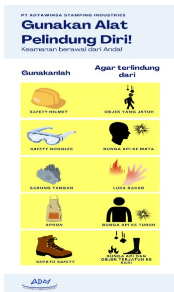
Figure 5. PPE Instrument Proposal Design (1)

In the last proposal in the study, the designed instrument can be used as an educational tool and reminder for workers. The instrument is in the form of an infographic poster that contains short, concise, and clear warnings. The poster design explains what may happen if PPE is improperly used. This takes inspiration from spooky images on cigarette packs in Indonesia. Similar to the purpose of the spooky image on cigarette packs, the existence of images that show the impact of accidents that occur when not using PPE is expected to awaken the awareness of workers who see the poster. The designed instrument can be seen in Figures 5, 6, and 7.