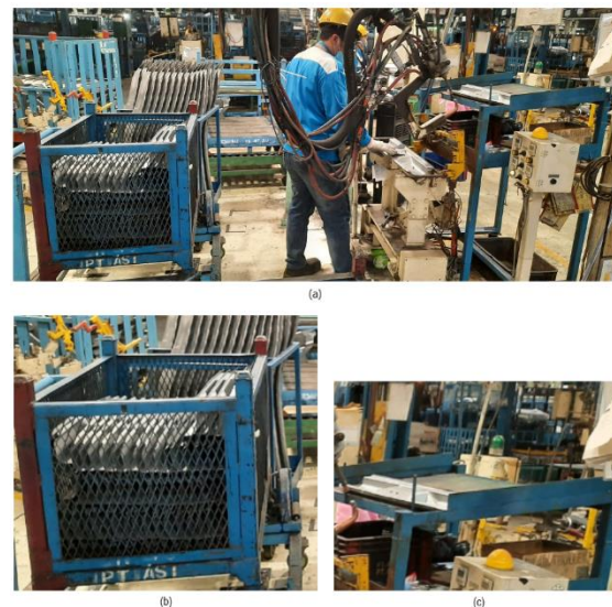
Figure 3. Welding Department Work Area

The results of the grouping of hazard identification and potential hazards are included in the subsequent FMEA evaluation process. In the FMEA, the category of work accidents