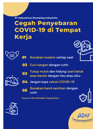
Figure 7. COVID-19 Instrument Proposal Design