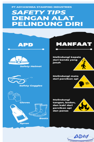
Figure 6. PPE Instrument Proposal Design (2)