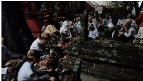
Grebek Syawal 1443H Pilgrimage