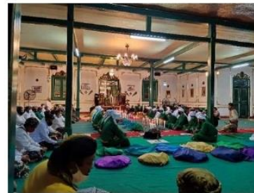
Pelat Ageng in Bangsal Prabayaksa Keraton