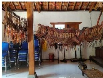
Ngisis Wayang Tradition