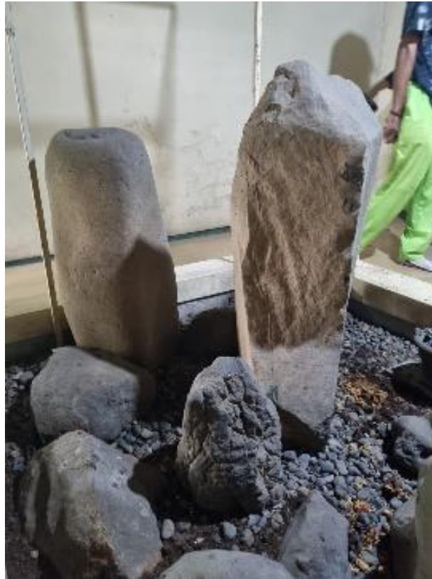
Figure 10. Megalithic Stone

Some may also have served as markers or altars in Ancient Sundanese religious rituals. These stones have high archaeological value and provide insight into the religious beliefs and practices of the Sundanese people.