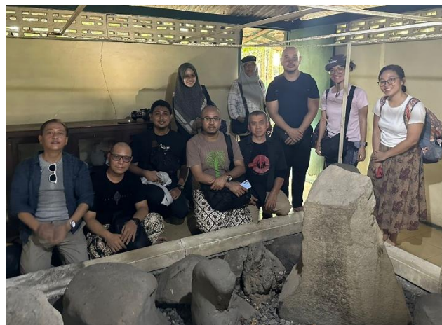
Figure 4. Batu tulis (May 2024)

The Runjungpati site also has beautiful and unique architecture, which reflects the greatness and beauty of the Pakuan Pajajaran Kingdom in the past. Several buildings and structures on the site have been restored and preserved, so visitors can see and admire the architectural wonders of the past. Apart from that, this site is also an interesting historical tourist destination for visitors who want to learn more about the history and culture of the Pakuan Pajajaran Kingdom.