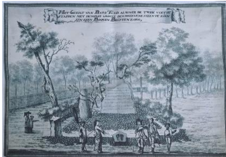
Figure 8. The Picture of Life and Culture Community Pakuan Padjadjaran

When slate inscriptions and footprints are found in the same location or in the same context, they can provide important clues in the reconstruction of history, community life and religious beliefs in the past. The combination of slate inscriptions containing written information and footprints containing certain symbolism can help archaeologists and historians understand more deeply aspects of people's life and culture in the past.