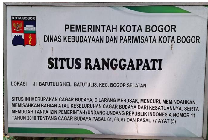
Figure 3. Situs Rangapati (May 2024)

because it was an important place in the life of the kingdom. Rangpati is known as a place for meetings, celebrations of religious ceremonies and other cultural activities.