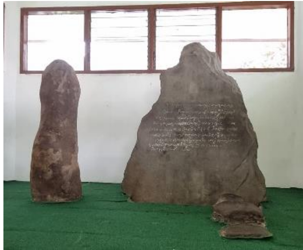
Figure 7. The slate inscriptions around the Pakuan Pajajaran Palace

The slate inscriptions found around the Pakuan Pajajaran Palace in Bogor are one of the historical relics that provide valuable information about the life, culture and history of the Pakuan Pajajaran kingdom.