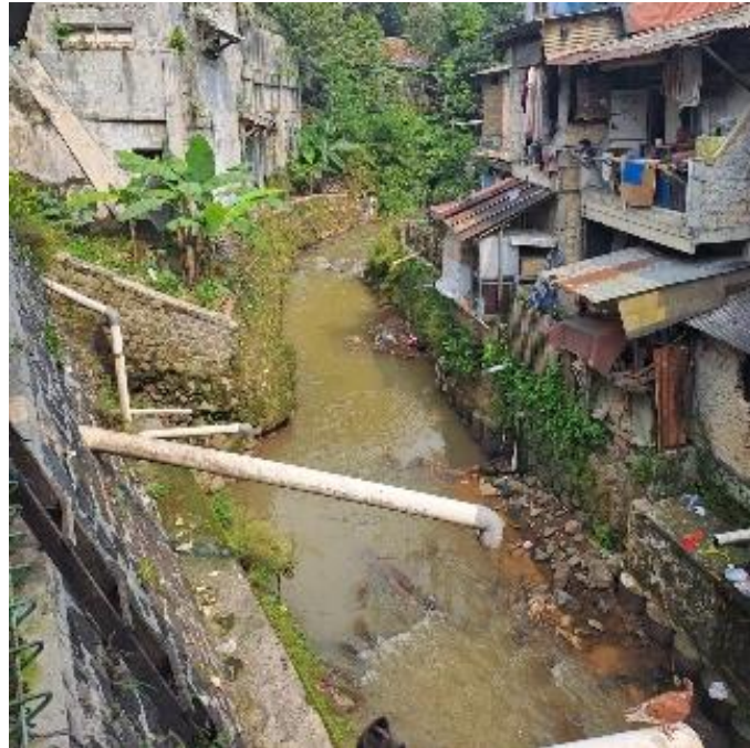
Figure 6. Cipakancilan River

During the Pakuan Pajajaran Kingdom in Bogor, the Cipakancilan River was used for various purposes that were vital for people's lives at that time. This river has an important role in supporting daily life and the continuity of the kingdom. Some uses of the Cipakancilan river during the Pakuan Pajajaran Kingdom could include: