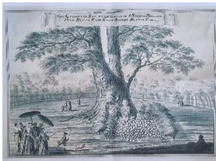
Figure 9. The Picture of Cultural Life of Society Pakuan Padjadjaran

When slate inscriptions and footprints are found in the same location or in the same context, they can provide important clues in the reconstruction of history, community life and religious beliefs in the past. The combination of slate inscriptions containing written information and footprints containing certain symbolism can help archaeologists and historians understand more deeply aspects of people's life and culture in the past.